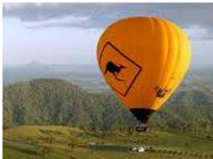
Hot air ballooning