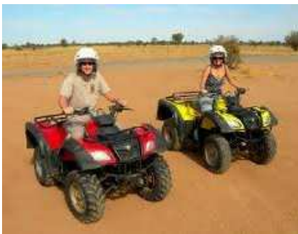
Quad bike riding