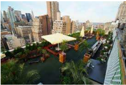
A Melbourne roof-top bar