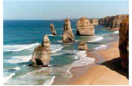
The Twelve Apostles