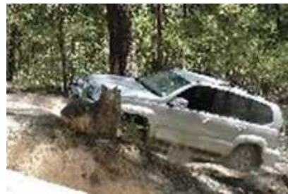
4 wheel driving