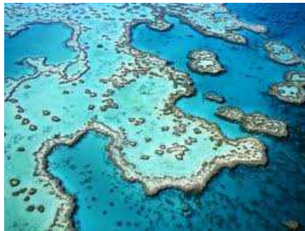
The Great Barrier reef