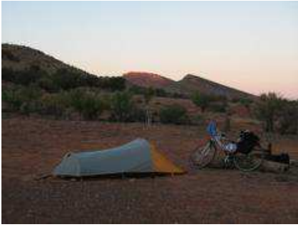
A bush camp