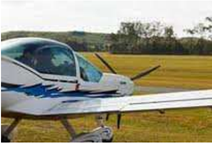
Flying a light plane