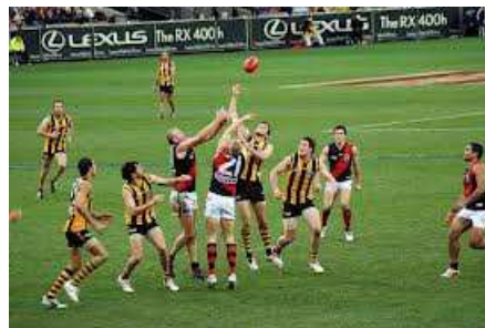
Aussie rules football