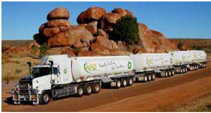
A truck / A "road train"