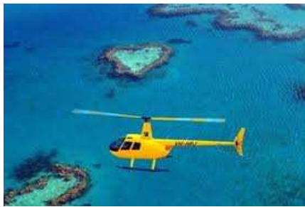
Flying a helicopter